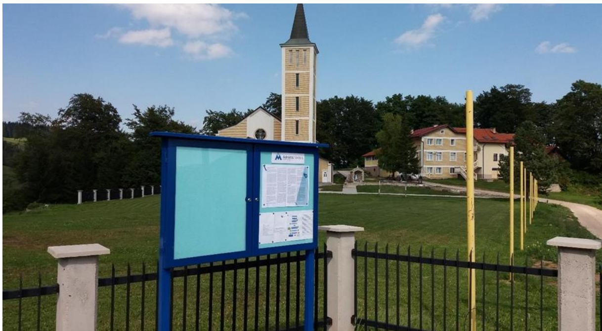
Photo 4.1.1. Notice Board Borovica

Document and reports, such as this SEP, that are too large to display on the notice boards will be made available, in Bosnian, at the Info Centre and will be downloadable from the Eastern Mining website and will be available to or through representatives of local communities.