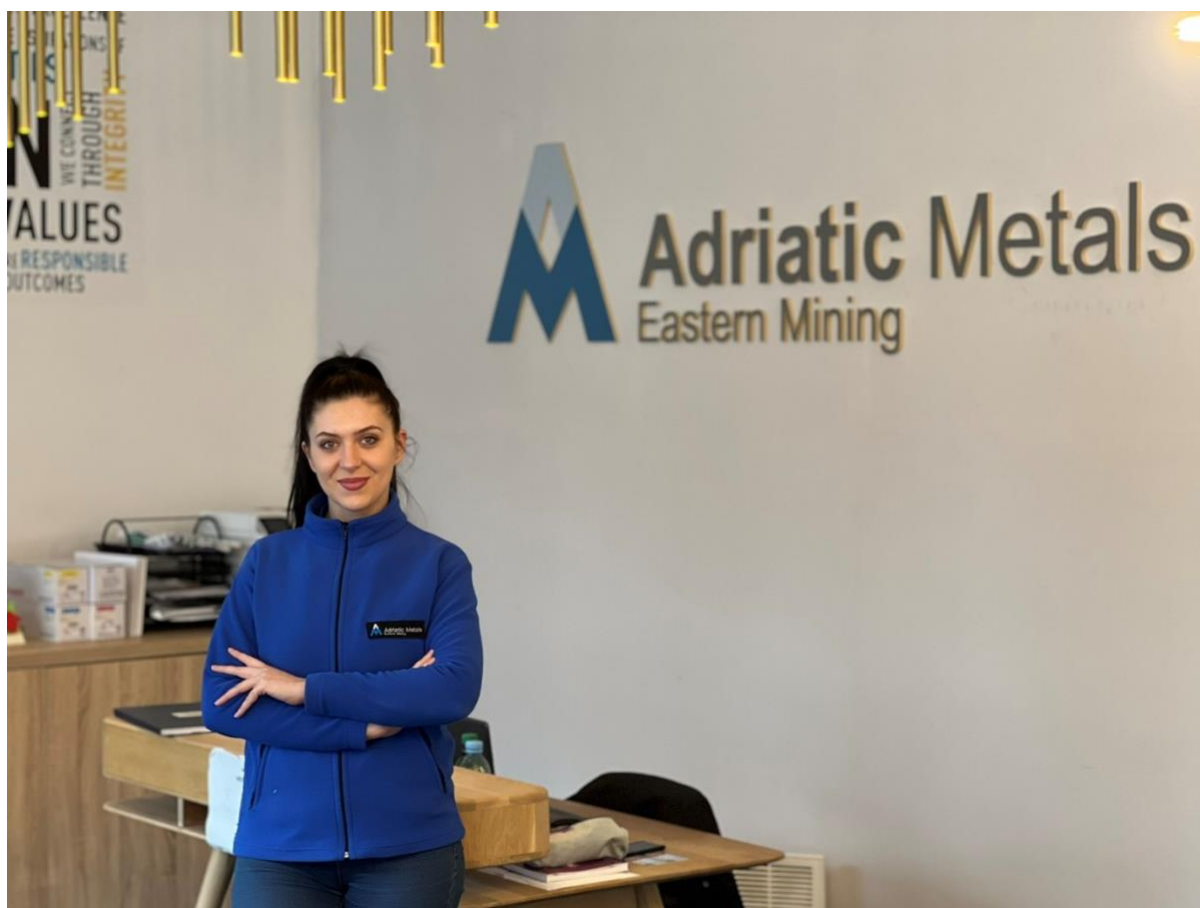
Photo 4.2 Eastern Mining Information Centre, Vares

The Information Centre administers a formal grievance mechanism, discussed in Chapter 5 of this SEP, as well as the formal register of stakeholders engaging at the centre and a record of all donations, requests and sponsorship carried out by the company. All Project related documentation such as the Scoping Study, Environmental Assessment for local permitting procedures, international ESIA and management plans, NTS And ESAP plus, non-technical summaries of all technical aspects and the permitting register will be available on request. Any interested party can submit their request through the Information Centre. Having this information to hand will assist the Eastern Mining employees in ensuring all responses to queries are consistent and accurate.