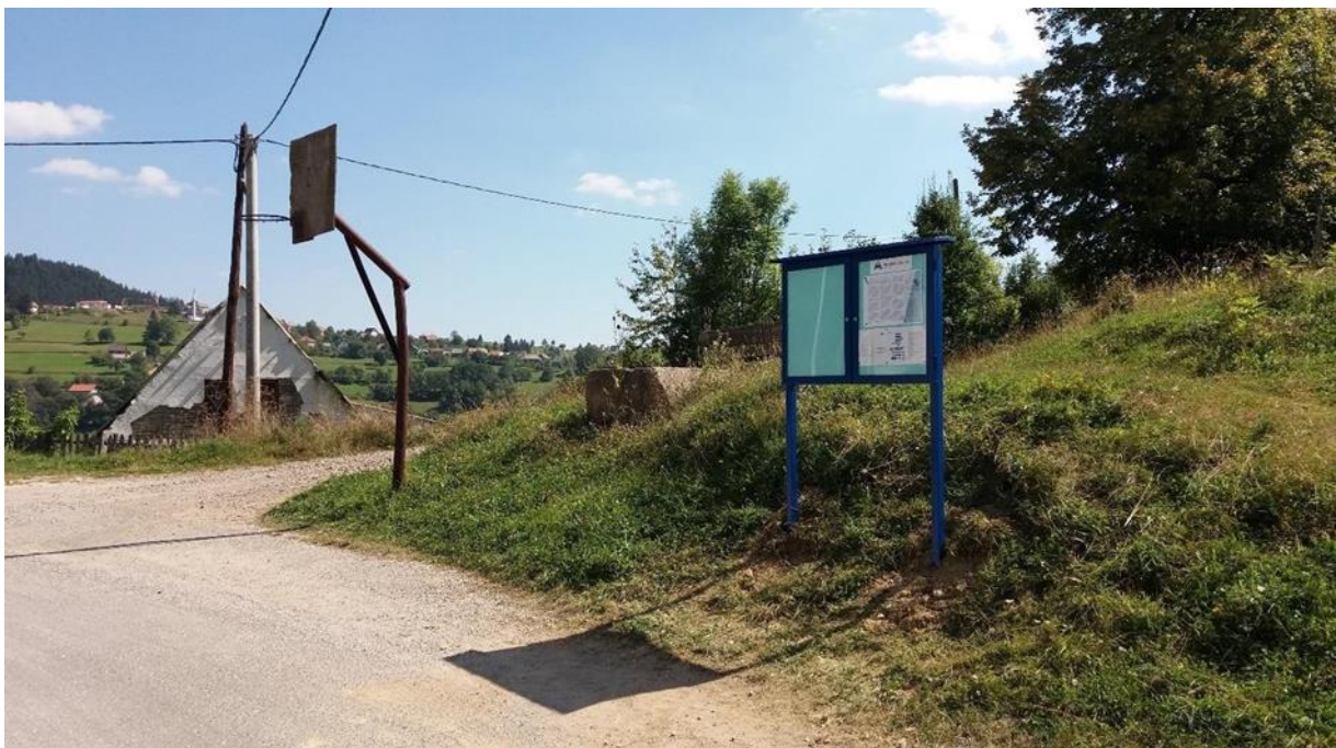
Photo 4.1.3 Notice Board Przici