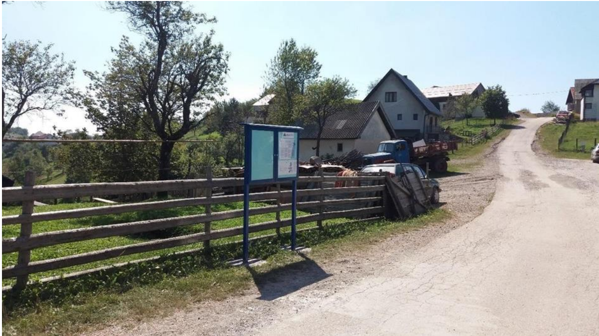
Photo 4.1.2. Notice Board Dastansko