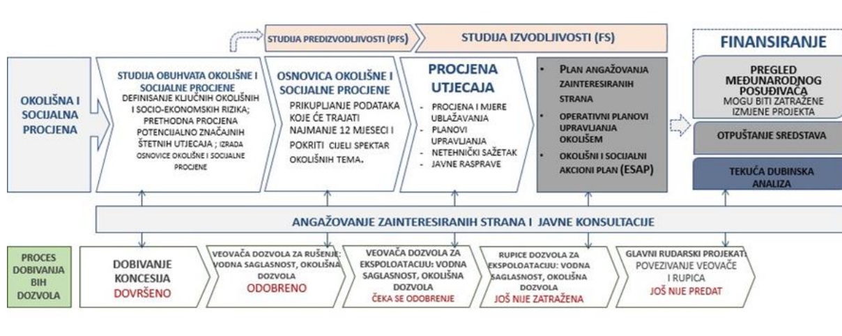
Figure 4.1 ESIA Process aligned with Technical Studies and BiH Permitting Process

Stakeholder consultation is a vital component of the ESIA process and technical studies (Figure 4.1). Consultation was initiated during the scoping study for the ESIA and has continued throughout the baseline period and once the impact assessment documentation was completed in draft. Key stakeholders were being identified and interviewed as part of this process and engagement with them was and is ongoing.