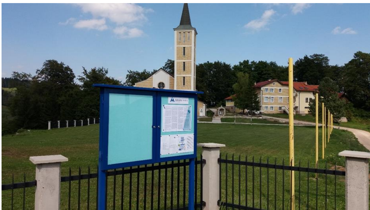
Figure 8.2: Adriatic Metals Notice Board in Borovica