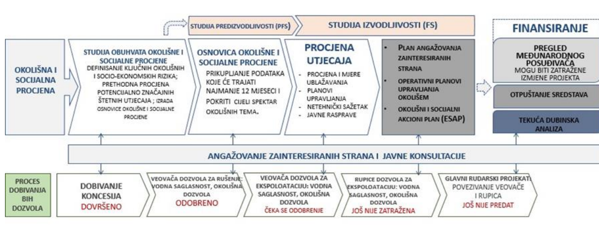
Figure 1. ESIA Process aligned with Technical Studies and BiH Permitting Process

Stakeholder consultation is a vital component of the ESIA process and technical studies (Figure 4.1). Consultation was initiated during the scoping study for the ESIA and has continued throughout the baseline period and once the impact assessment documentation was completed in draft. Key stakeholders were being identified and interviewed as part of this process and engagement with them was and is ongoing.