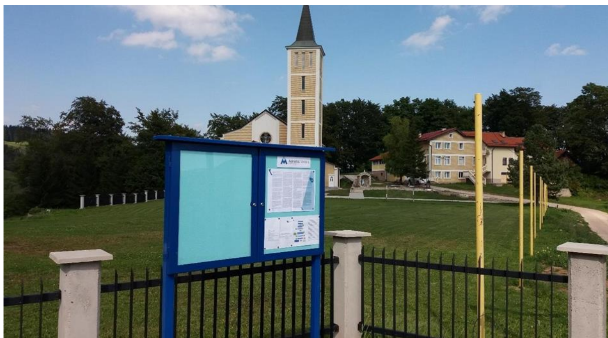
Photo 4.1.2. Notice Board Borovica

Document and reports, such as this SEP, that are too large to display on the notice boards are made available, in Bosnian, at the Info Centre and will be downloadable from the Adriatic Metals website and will be available to or through representatives of local communities.