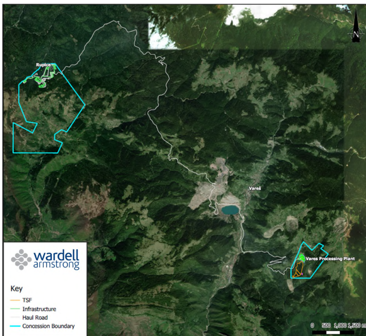
Figure 2.1: Vares Project Layout

The Project broadly consists of underground polymetallic mining at Rupice, the haulage of ore via a purpose-built haul route 24.5km to the Vares Processing Plant, processing of ore and the movement of tailings back to Rupice for paste backfill. Waste rock will be stockpiled at Rupice, before being used as part of backfill. Tailings not used in backfill will be stored in a dry stack facility, designed to meet the capacity requirements across the life of mine, located in a valley south of the processing plant. The final lead-silver and zinc concentrates will be transported to a rail loadout facility in Vareš and then onwards for further refinement and sale. The Project layout is shown in Figure 2.1.