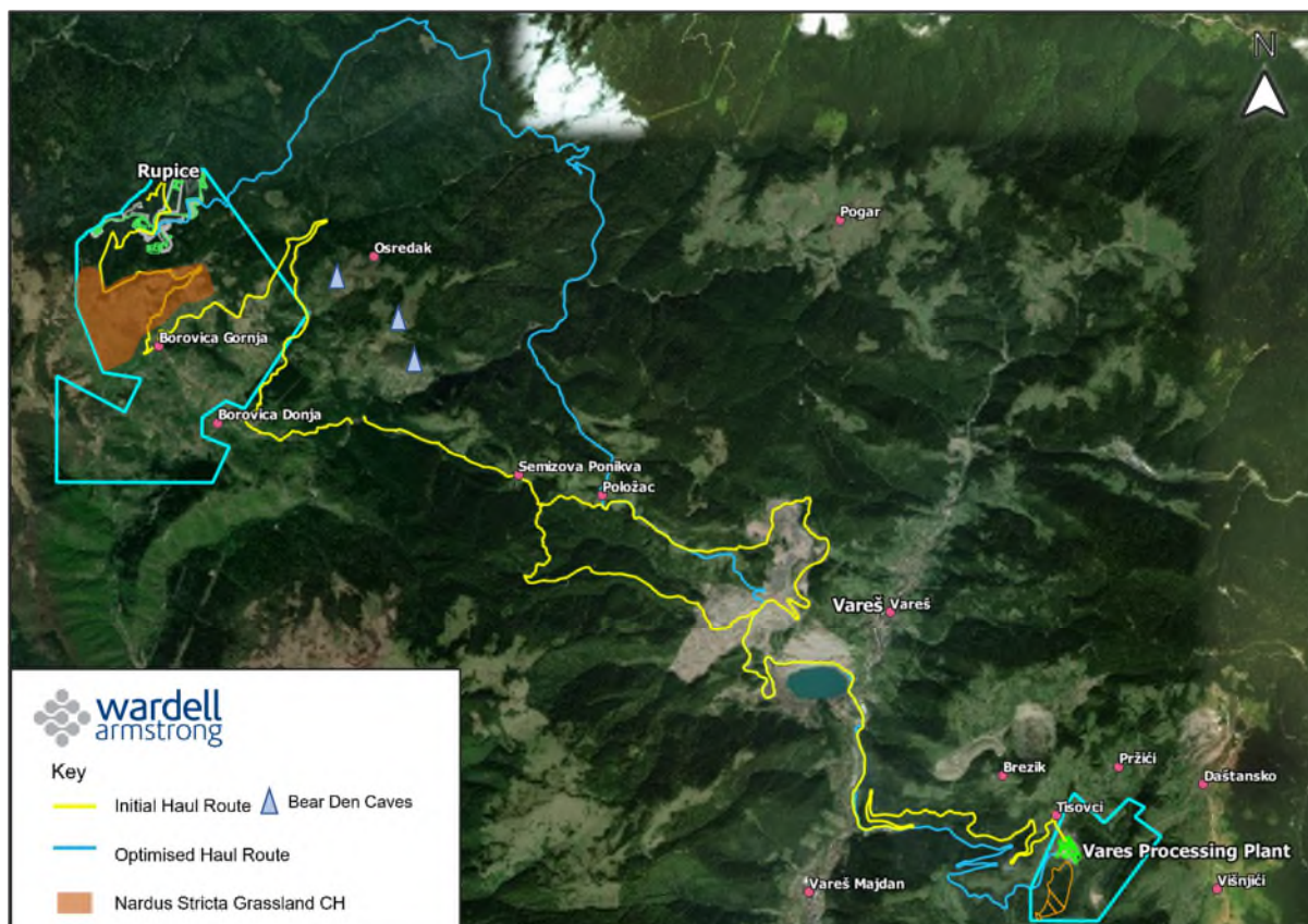
Figure 6.3: Haul Road Routing Options

constructed through the forested slopes of the Zagarski river valley, along and adjacent to the Zagarski stream and into Vareš. The road will pass around the Smreka Iron Ore pit, westward to Položac before turning north and routing around and away from residential receptors. The stretch of road from here follows partially along forestry tracks that will require upgrading, before reaching the Rupice site. As shown in Figure 6.3 the road traverses to the north quite significantly prior to entering Rupice. This section of the road has been placed here due to the topography of the region hence to minimise the gradient of the road. This route also utilises existing tracks as far as possible, with approximately a third of this section on forestry roads, thus further minimising impact from land take.