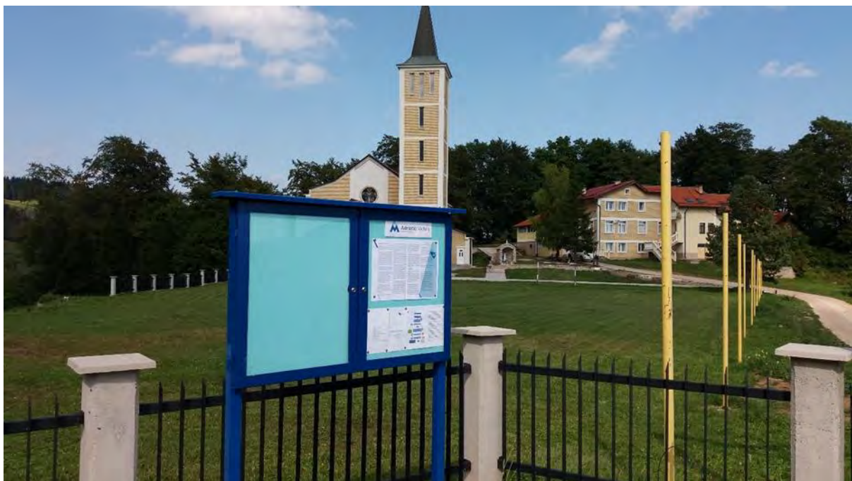
Figure 8.2 Adriatic Metals Notice Board in Borovica