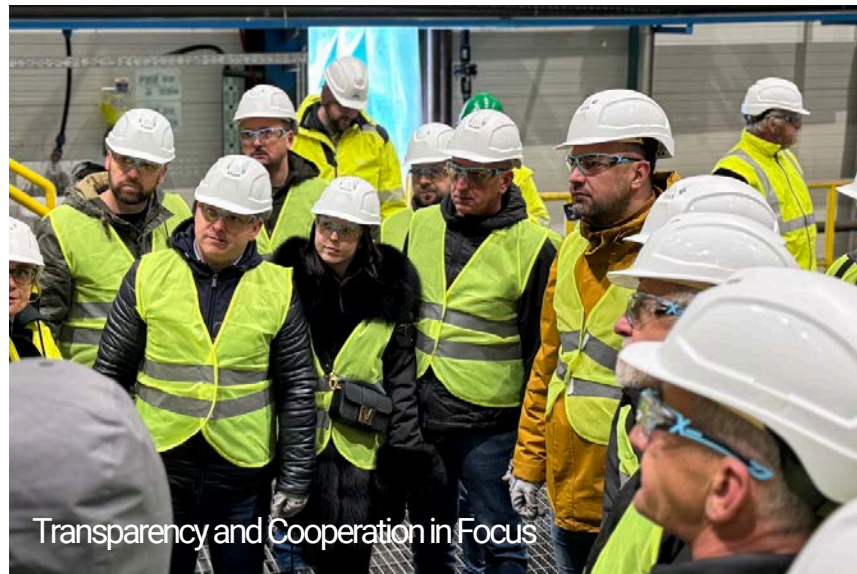
Transparency and Cooperation in Focus

The visit began with a mandatory safety induction, highlighting the company's commitment to the highest standards of health and safety. Following this, the council members toured the ore processing plant.