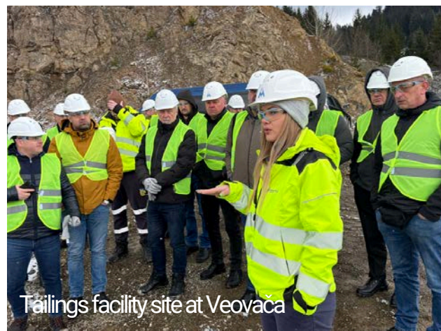
Tailings facility site at Veovača