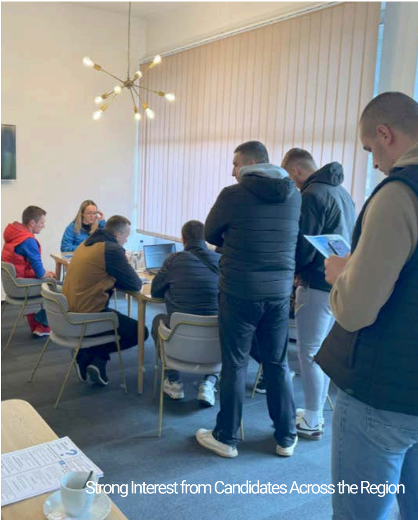
Strong Interest from Candidates Across the Region

The Open Day once again demonstrated Adriatic Metals BH's commitment to a transparent and responsible recruitment process, as well as its ongoing investment in people as a key resource for sustainable and successful operations.