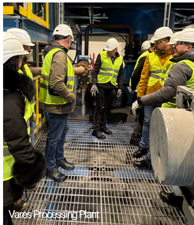
Vares Processing Plant